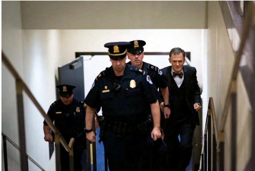
George P. Kent, right, the deputy assistant secretary of state for European and Eurasian Affairs, told impeachment investigators that he had raised concerns about Hunter Biden in 2015.

In the end, it was an unglamorous holding action, but one that suited Mr. Biden's Mr. Fix-It approach to the vice presidency — and his view of Ukraine as the front line in a larger battle to contain the Russian president, Vladimir V. Putin.