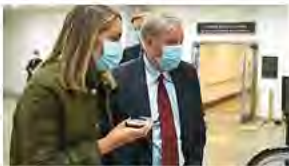
Senate Republicans signal openness to...