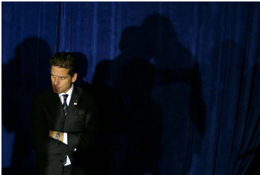
Hunter Biden, the former vice president's son, served on the board of the Ukrainian energy company Burisma Holdings.

They emphasized "private citizen," many former aides said, because the vice president would not even discuss taking the step that could make all questions vanish: asking his son to quit the Burisma board, as editorial boards and Ukraine experts were suggesting.