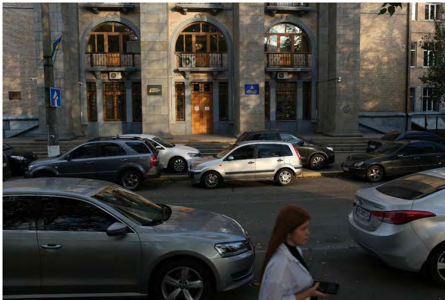
The National Anti-Corruption Bureau in Kiev.

That December, in a speech that he later described as one of the most important he had ever delivered, the vice president told legislators they had "to remove all conflicts between their business interest and their government responsibilities." He also singled out the natural gas industry, saying, "The energy sector needs to be competitive, ruled by market principles — not sweetheart deals."