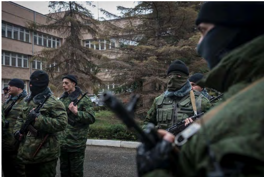
Pro-Russian forces in Crimea in March 2014.

Mr. Putin then rushed in, annexing Crimea and backing paramilitaries who invaded the country's east. While Mr. Biden's pitch for missiles was rebuffed, he eventually helped sell Mr. Obama on sending about 100 American service members to train Ukraine's security forces.